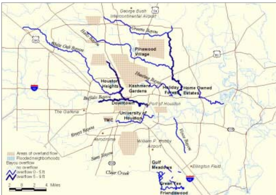
Figure 3. General overview of the extent and types of flooding in the Houston region caused by TS Allison.

In just 5 days, Allison dropped 80% of the Houston region's total average annual rainfall, which was 170% of the 500-year rainfall event calculated for the region. Flood control systems and bayous were overwhelmed. The Harris County Office of Emergency Management recorded severe and record breaking flooding on 15 major bayous in central Harris County. Five of six major bayous running through central Houston overtopped their banks, and 4 of them (Greens, Buffalo, Halls, and White Oak bayous), exceeded their 100-year flood levels. Greens Bayou crested at nearly 20 feet (6 meters) above its banks. Surface water run-off was also excessive, and depths of 5 feet (1.6 meters) were recorded near the Texas Medical Center (TMC) and Rice University.