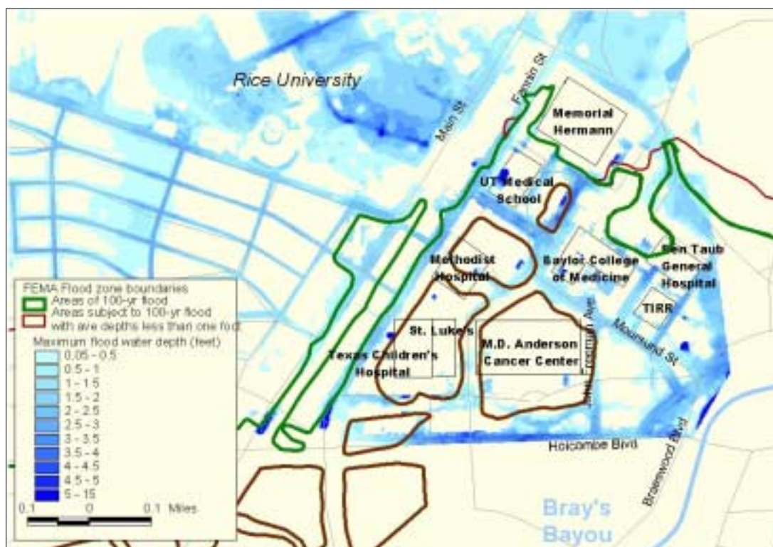
Figure 4. Flooding in the TMC was almost entirely caused by inadequate storm water drainage and resulting surface water build-up on streets. As shown in this image, flood depths of more than 5 feet (1.6 meters) were recorded on TMC streets.

In 1976, heavy rains caused more than $20 million in flood-related damage in the TMC. Subsequent flood mitigation efforts, particularly the installation of flood control devices such as floodgates, were designed to retain the 1976 flood level, generally considered to be about a 100-year event. The Rice/TMC Flood Alert System (FAS) was also developed the year following the 1976 floods. The FAS uses radar to estimate rainfall over the Brays Bayou watershed and predict flood conditions within the TMC.