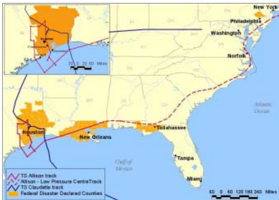
Figure 2. TS Allison's path (red) across the U.S., along with TS Claudette's 1979 track (blue). Federally-declared disaster areas for TS Allison are shown in orange.

A similar phenomenon occurred in the Houston area in 1979, when Tropical Storm Claudette came onshore near the Texas-Louisiana border on July 24 and then stalled. Forecasters expected Claudette to continue northward, but changes in upper atmospheric winds caused the system to loop over southeast Texas in a path similar to Allison's. Claudette still holds the U.S. record for the maximum 1-day rainfall of 43 inches (1.1 meters). Fortunately, Claudette's heavy rains fell mostly in rural areas south of Houston, and the losses from the storm were much lower than those observed in TS Allison.